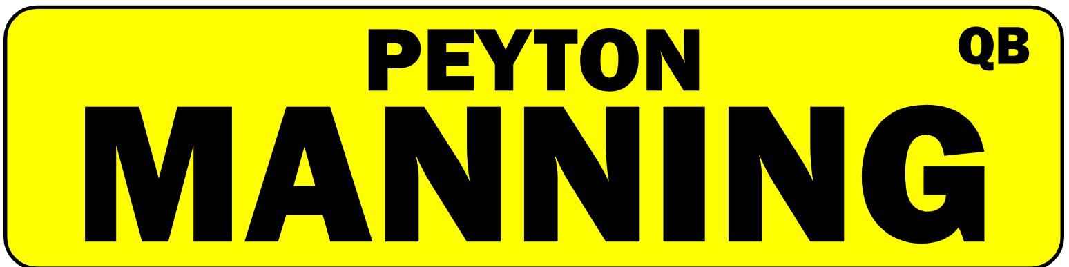
Jumbo Size Labels 2 inches by 8 inches