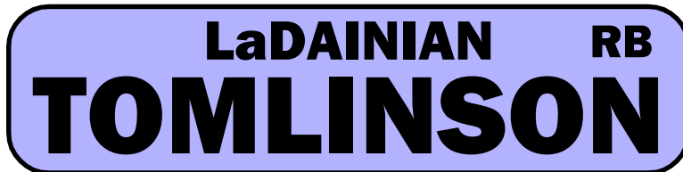
Regular Size Labels 1 inch by 4 inches